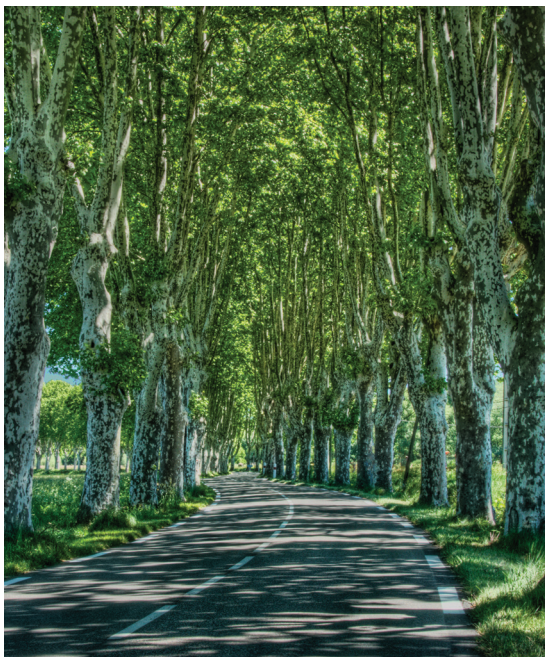
Plane tree avenue