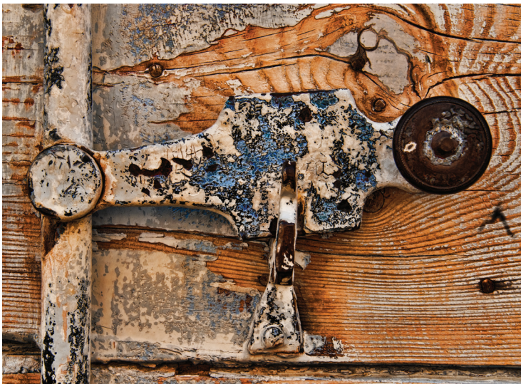
Latch in Céreste

Lourmarin, the former home of Albert Camus,